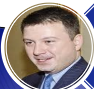
Archil Kekelia , First Deputy Minister of Economy and Sustainable Development of Georgia