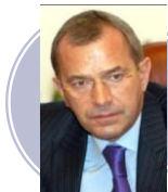
Andrey Kliuev , First Vice Prime Minister of Ukraine