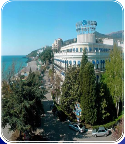
Oreanda Hotel, Yalta