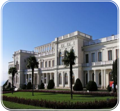
Livadia, Livadia Palace