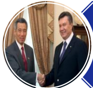
Ambassador Tony Siddique , Ministry of Foreign Affairs of Singapore