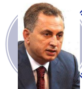
Boris Kolesnikov , Vice Prime Minister of Ukraine for EURO 2012