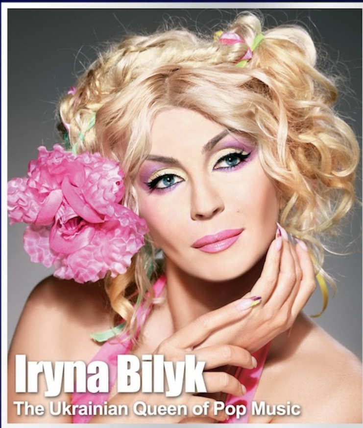
Iryna Bilyk The Ukrainian Queen of Pop Music

Chicago's Unique Event Top Guest Stars from Ukraine